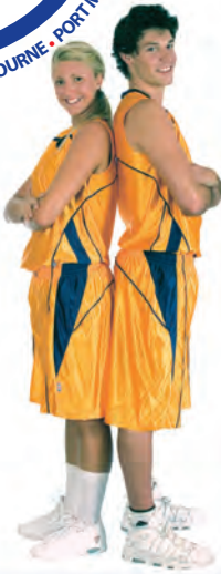
Style: Astro Gold / Navy