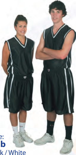
Style: Club Black / White