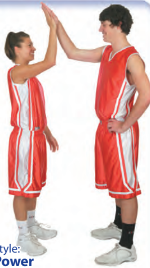
Style: Power Red / White