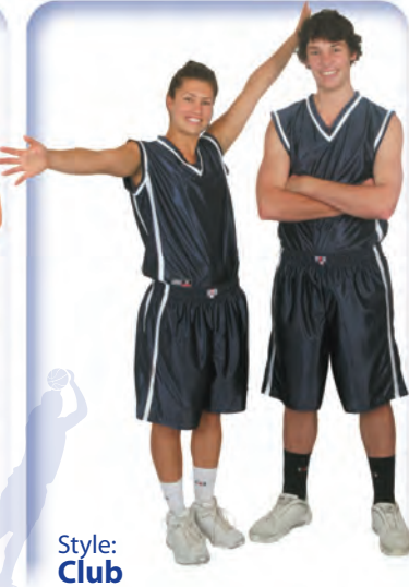
Style: Club Navy / White