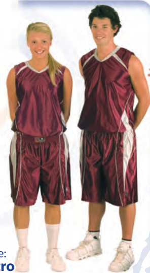
Style: Astro Maroon / Silver