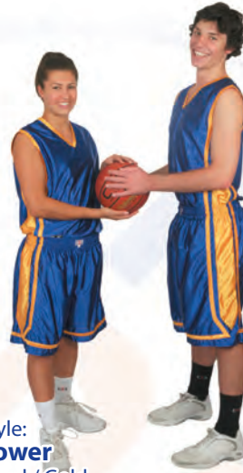
Style: Power Royal / Gold