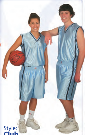
Style: Club Sky / Navy