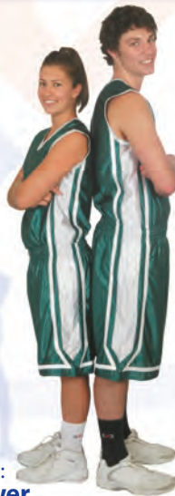
Style: Power Bottle / White