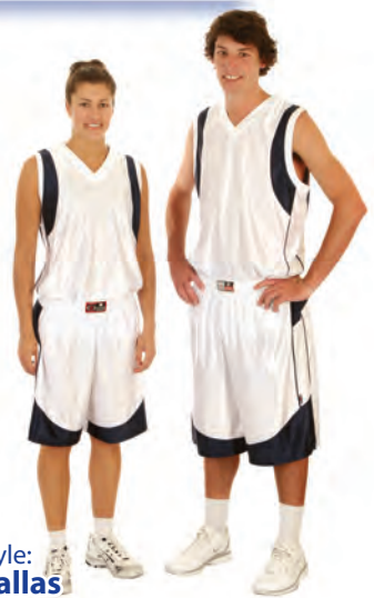
Style: Dallas White / Navy

ONLINE PRICE order on-line at www.coast2coastsports.com.au