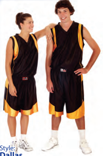
Style: Dallas Black / Gold