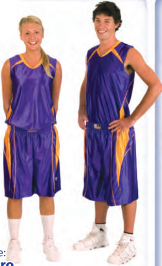
Style: Astro Purple / Gold